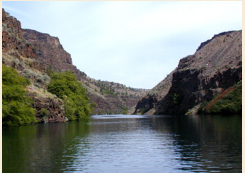
A view from the narrows looking downriver towards the curve and slide area.