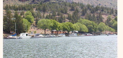
Lake Simtustus RV Park moorage from the lake.