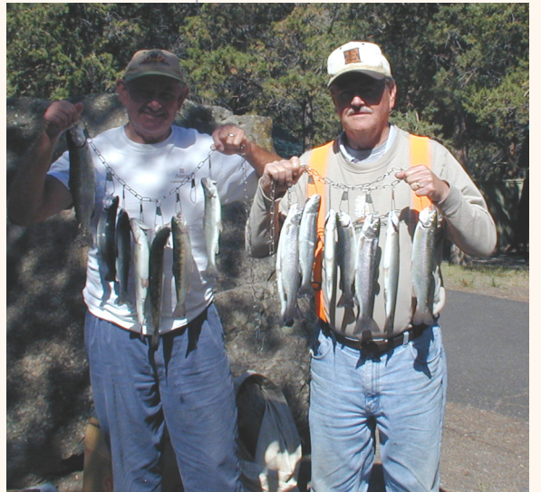
A mornings catch of fish, one short of a limit for the boat. All are steelhead trout, ranging in size from 11-14 inches. They were caught on the troll in the slide and narrows areas of the lake.