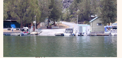
Pelton Park marina & store.