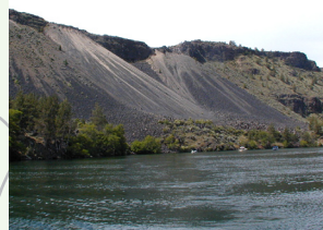
The slide approaching from downriver.