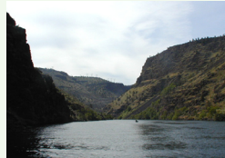
A view from the narrows looking upriver towards Round Butte Dam.