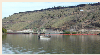
Pelton Dam from the lake above the dam.