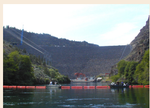
A view of Round Butte Dam from just below the barrier at the head of Lake Simtustus.