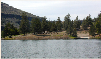
Indian Campground shot from the lake looking back upriver.